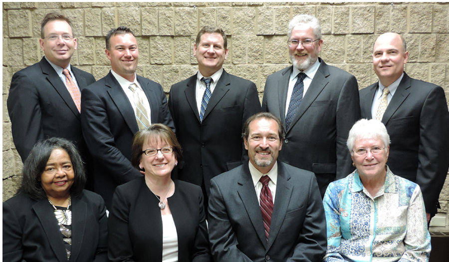
GLCU Board of Directors